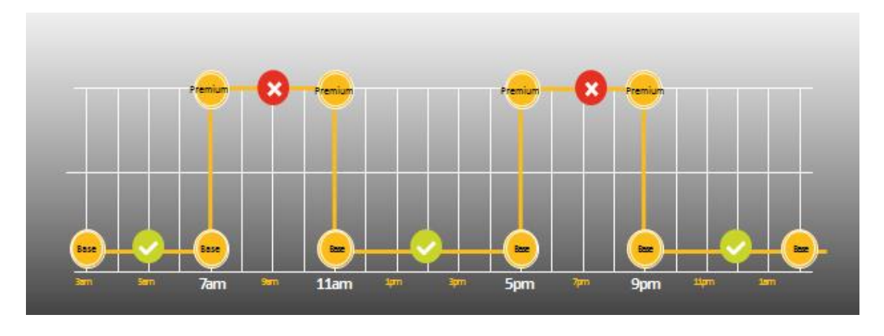
Figure 3 – Residential ToU pricing structure

Figure 4 compares the standard time periods against demand patterns on our network. The residential ToU structure is a good match to the Wellington region's demand patterns.